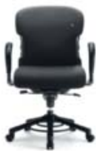
O 652 Backrest height 56 cm

All XXXL models come with an Interstuhl long-term warranty of five and a full warranty of three years.