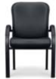
O 450 Visitor's chair