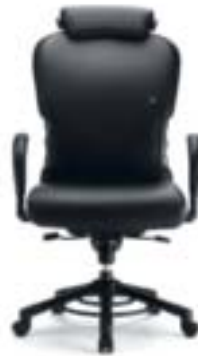
O 665 Backrest height 78 cm